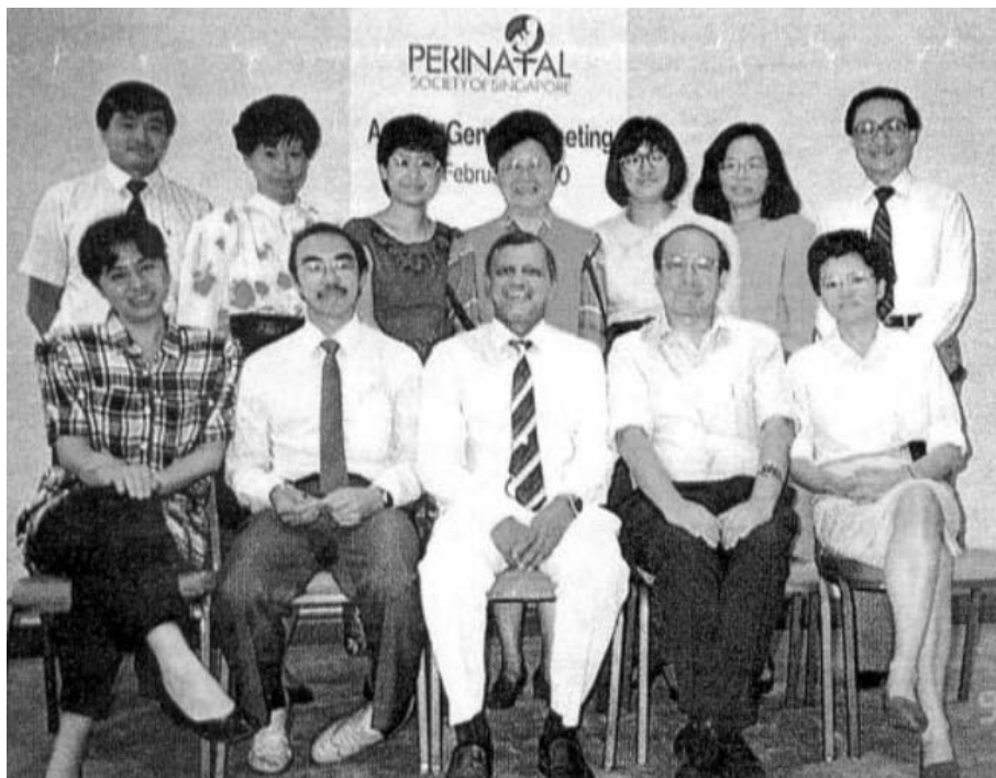
The 2 nd AGM of the Perinatal Society of Singapore was held on 24 Feb 1990 at the Meridien Hotel.